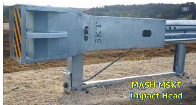
MASH MSKT Impact Head

The MSKT Impact Head is able to be used on NCHRP 350 SKT units for new installations or for repairs. ADDING THE MSKT IMPACT HEAD DOES NOT RETROFIT NCHRP 350 SKT INTO THE MSKT. The letters “SKT” are cut into the traffic side of the MSKT Impact Head. This is because there will be NCHRP 350 SKT installations and there will be MASH MSKT installations, both with the same head. The other changes noted above will distinguish the MASH MSKT from the NCHRP 350 SKT.