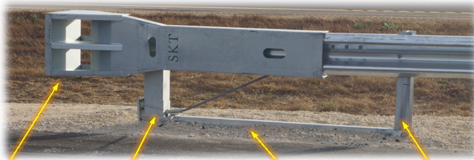
MSKT Impact Head MSKT Upper & Lower Post 1 MSKT Ground Strut MSKT Upper & Lower Post 2