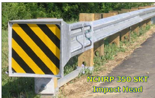
NCHRP 350 SKT Impact Head